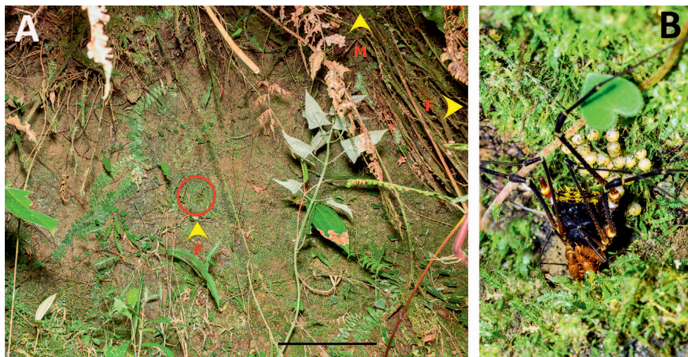
Figure 2.—(A) Damp pocket in a roadside bank where we found two egg-tending females (F) and a large adult male (M) of Phareicranaus aff. spinulatus . Only one female is visible in the photo (circle); the other female and the male were inside a rock crack and below roots and vines, respectively, but their positions are indicated by arrows (photo: Sebastián Vieira-Urbe). Scale bar = 0.5 m. (B) Egg-tending female of P. aff. spinulatus prostrated on a clutch containing 22 large eggs in early stages of embryonic development. Note that the eggs are covered by debris, which is probably attached to the egg surface by the egg-tending female (photo: Sebastián Vieira-Urbe).

the subfamily Ampycinae, and closely related to the clade K92 and the subfamily Manaosiinae (Pinto-da-Rocha et al. 2014). The subfamily Goniosomatinae is located far from the clade including the Cranidae (Pinto-da-Rocha et al. 2014). Although the phylogenetic position of the Cranidae as a clade within the Gonyleptidae still deserves further investigation, cranids and goniosomatines clearly do not share a recent common ancestor. Moreover, whereas cranids occur mostly in the northern region of South America, along the Andes and Amazon Basin up to Panama (Pinto-da-Rocha & Kury 2007), goniosomatines are restricted to the Atlantic forest, from southern to northeastern Brazil (DaSilva & Gnaspini 2009). Despite the distant phylogenetic relationship between cranids and goniosomatines, it is remarkable that they show so many convergences. Pinto-da-Rocha & Kury (2003) were the first to point out some morphological convergences between them, including large body size, stout and long legs bearing few spines, and robust and heavily armed pedipalps. Three years later, Machado & Warfel (2006) added other convergent traits related to behavior, such as maternal egg attendance of large eggs laid mostly on rock walls and damp pockets in roadside banks. The findings reported here extend the number of behavioral convergences to several traits of the mating system, which will be discussed below.