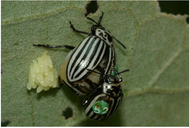
FIGURE 1 Male and female of the leaf beetle Leptinotarsa undecimlineata on the host plant after copulation. Note that the male (below) is smaller than the egg-laying female and that the abdomen of the female is very inflated due to the egg load in the reproductive tract, so that the two elytra do not touch each other.

plants and are rarely found elsewhere. Over the course of the breeding season, both males and females mate repeatedly and promiscuously. Following copulation, males usually perform mate guarding by staying near the female or mounted on her (Figure 1). Males may attempt to displace other males during copulation, but they do not perform prolonged territorial or female defense nor present any visible weapon or sexually dimorphic secondary trait (Baena & Macías-Ordóñez, 2012, 2015).